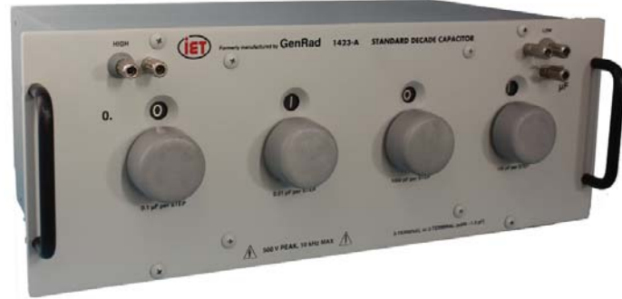
1423-A Decade Capacitor

Any value of capacitance from 100 pF to 1.111 \mu F in steps of 100 pF, can be set on the four decades and will be known to an accuracy of \pm 0.05\% , see specifications. The terminal capacitance values are set precisely to the nominal value and can be readjusted later at calibration intervals, if necessary, without disturbance of the main capacitors. The 1423 consists of four decades of high-quality silvered-